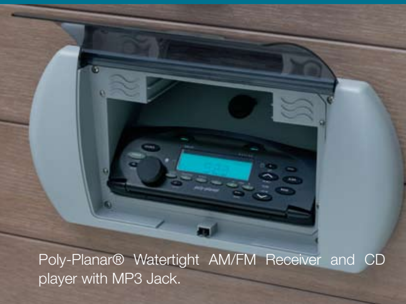
Poly-Planar® Watertight AM/FM Receiver and CD player with MP3 Jack.

Your search for the ultimate multi-sensory spa experience is over. Artesian's Platinum/Elite spas now offer two Poly-Planar® Stereo Systems*, the most innovative audio systems available for today's spa environment.