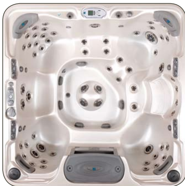
2.35m x 2.35m x 0.95m

It's no wonder the Piper Glen was awarded the Consumers Digest "Best Buy" Award in the Premium Category of spas. Loaded with 67 high-volume, sophisticated massage jets and four full-therapy seats, the Piper Glen certainly offers the ultimate spa experience.