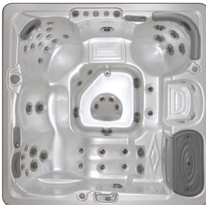
2.35m x 2.35m x 0.95m