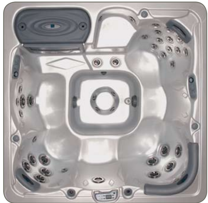
2.08m x 2.08m x 0.95m