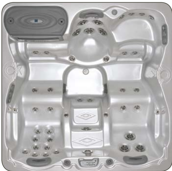
2.08m x 2.08m x 0.95m