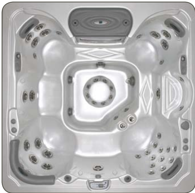
2.35m x 2.35m x 0.95m