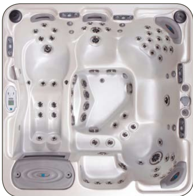
2.35m x 2.35m x 0.95m