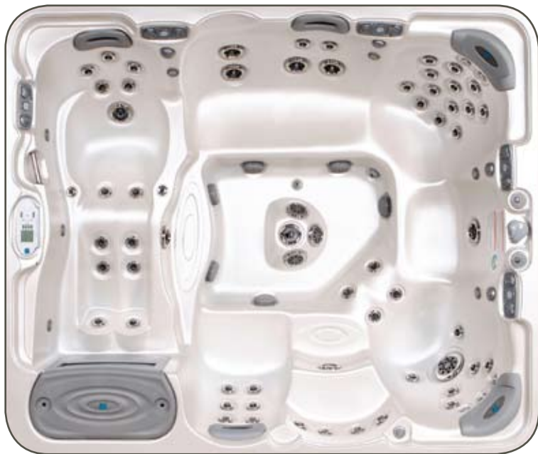
2.75m x 2.35m x 0.95m