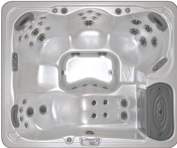
2.35m x 1.96m x 0.87m