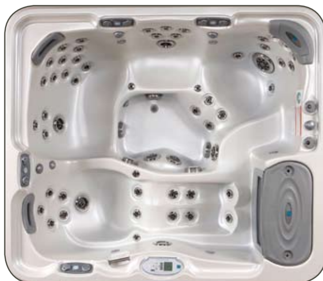
2.35m x 2.02m x 0.87m