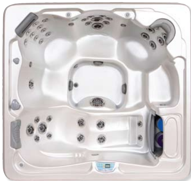
2.14m x 1.98m x 0.87m