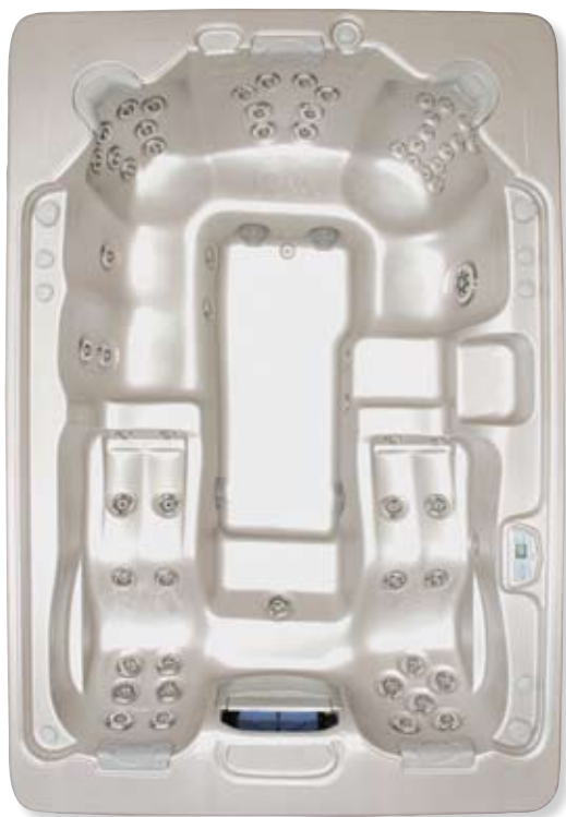
3.35m x 2.30m x 0.92m