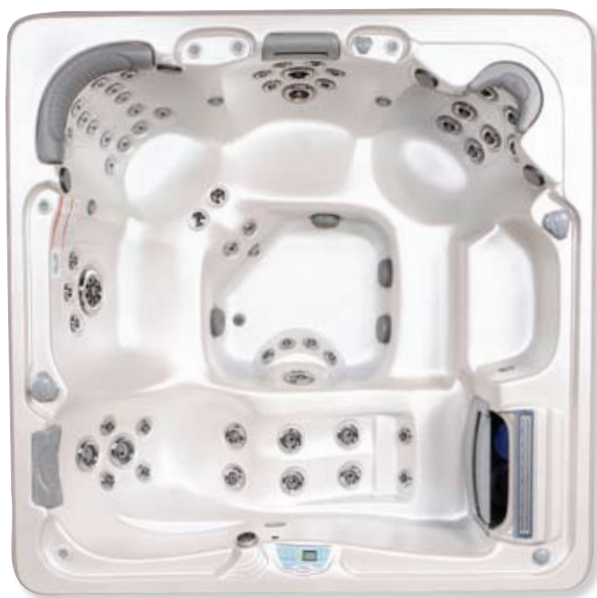
2.32m x 2.32m x 0.92m