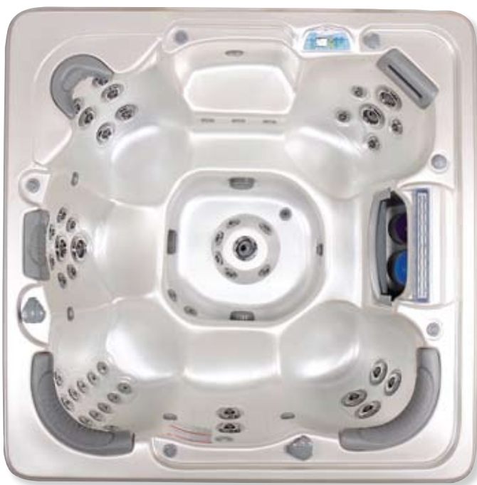
2.14m x 2.14m x 0.92m